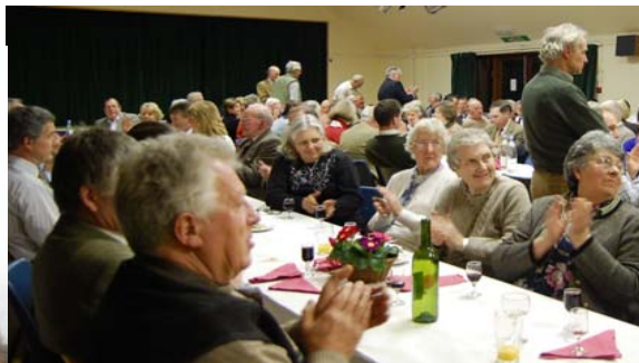
Peopleton Beef Supper