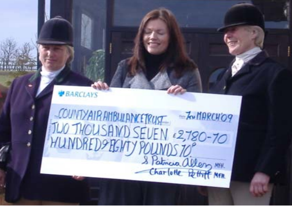
A cheque for £2780.70 was presented to the air ambulanc from the joint meet with the Worcesters on 12.2.09

The views expressed in this publication are not necessarily those of the committee, nor can the committee be held responsible for the accuracy of any advertisement or article. The editor reserves the right to edit or précis articles whenever necessary.